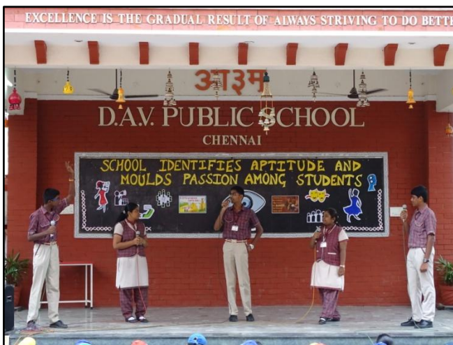
TALK SHOW – Gift of the Gab