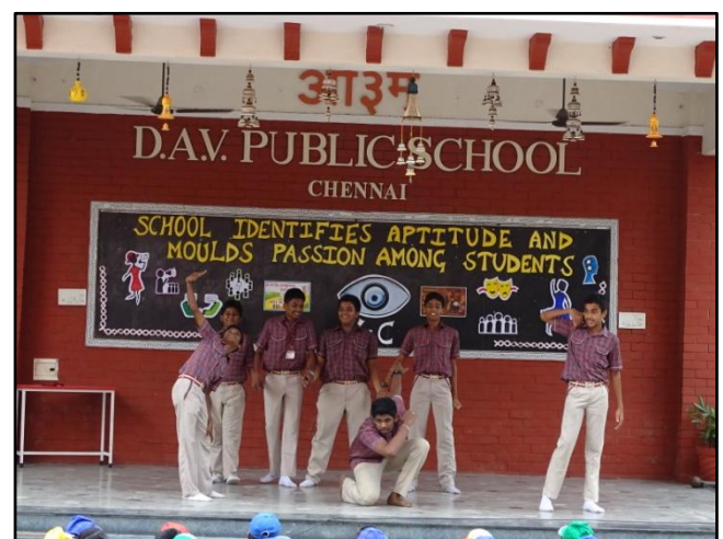
MIME – Speak through Silence