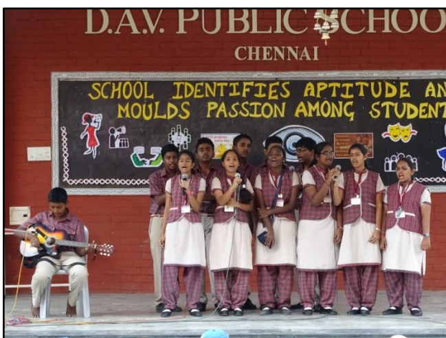
MELODIOUS RENDITION – Find the Depth