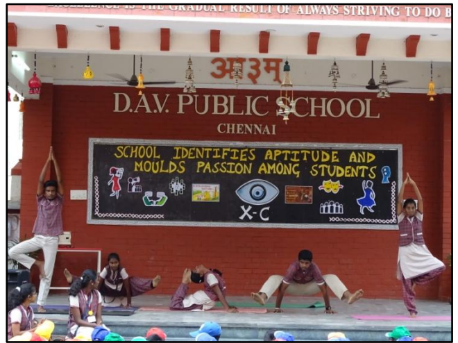
YOGA – Flex your Body, Calm your Soul