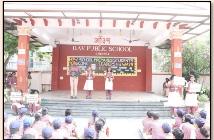
"Wunderkinds" of X - B