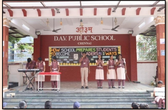
Nightingales of the Class