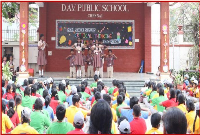
Engaging Minds Through Dramatic Vignettes