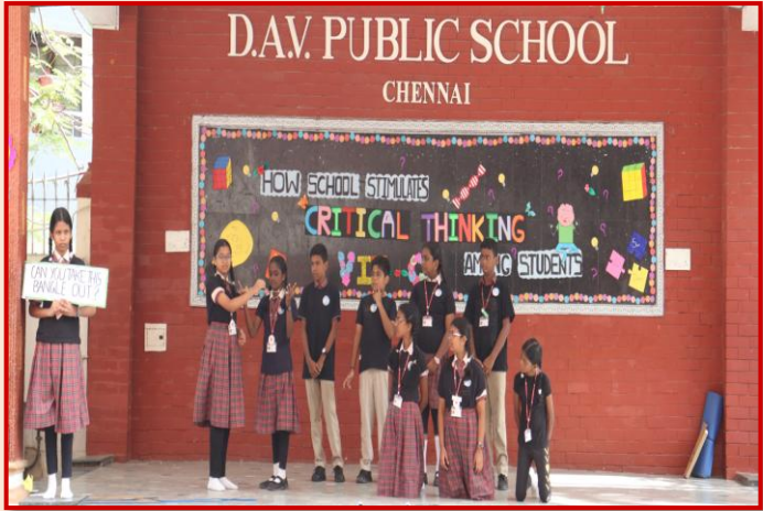
Skilled Pantomimist's Sparking Critical Thinking