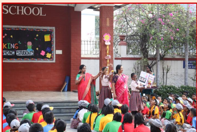
Honoured by the Principal's Presence and Appreciation