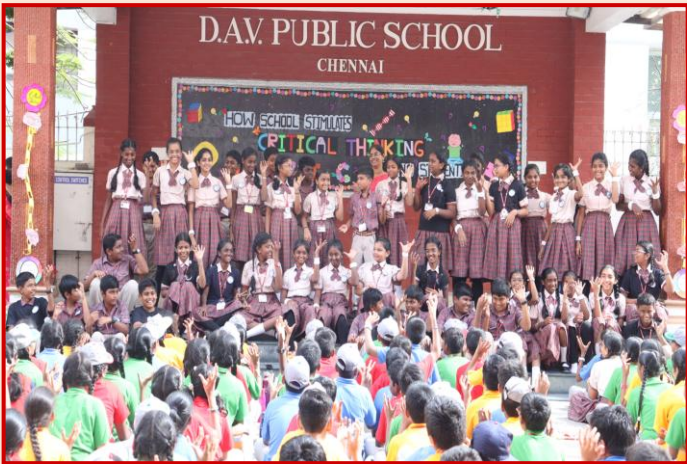
Making the Entire Audience Groove