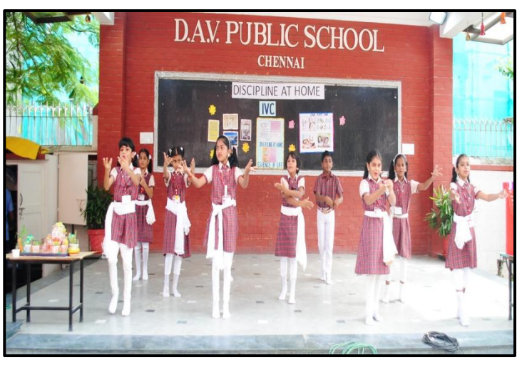
Dance depicting the steps of disciplined life