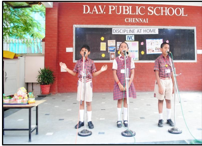
Story Telling - 'Value Enlightenment'