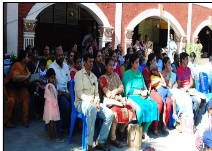
Elated parents watching their wards' performance