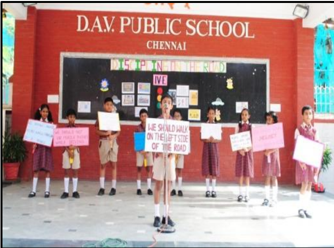
A Speech on 'Promoting Road Safety'