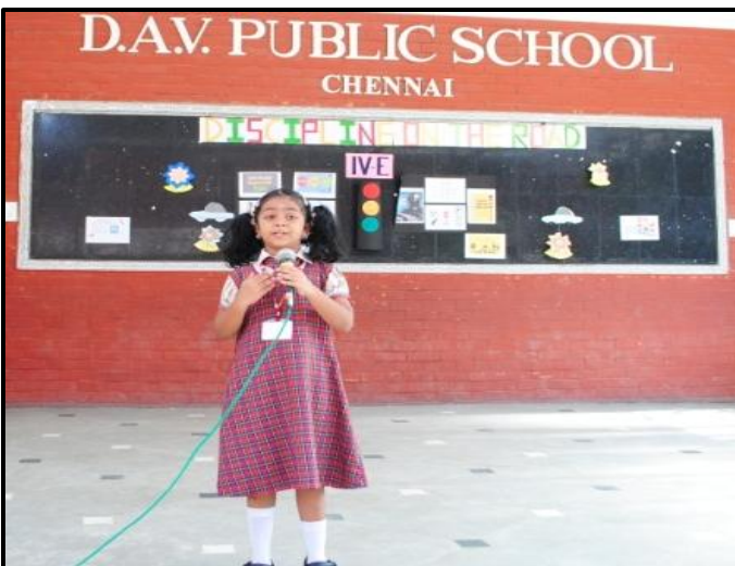
Vote of Thanks –Expression of Gratitude