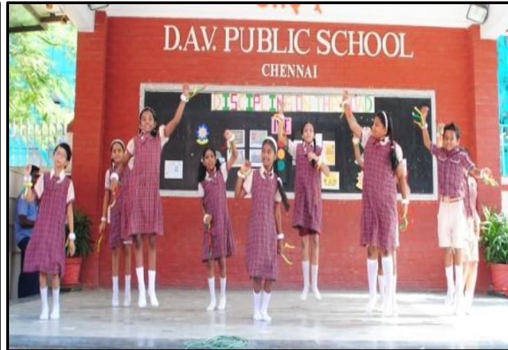
A Dance Performance on 'Discipline on Road'