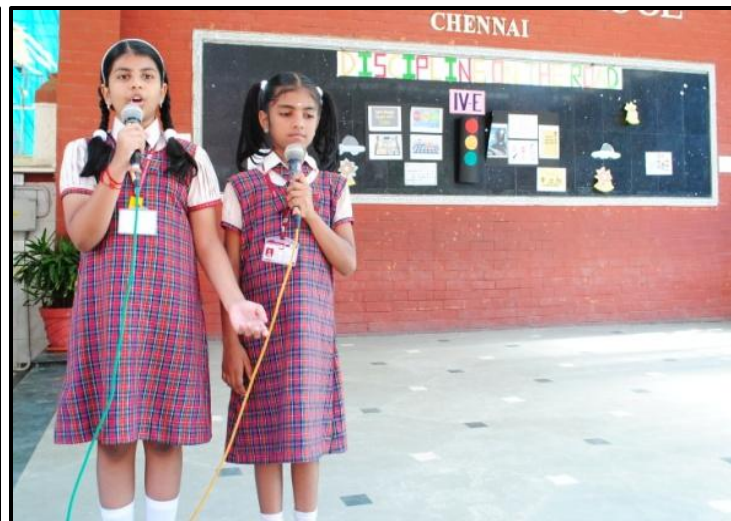
'May we explain?' - A Talk on dos and don'ts while on Road