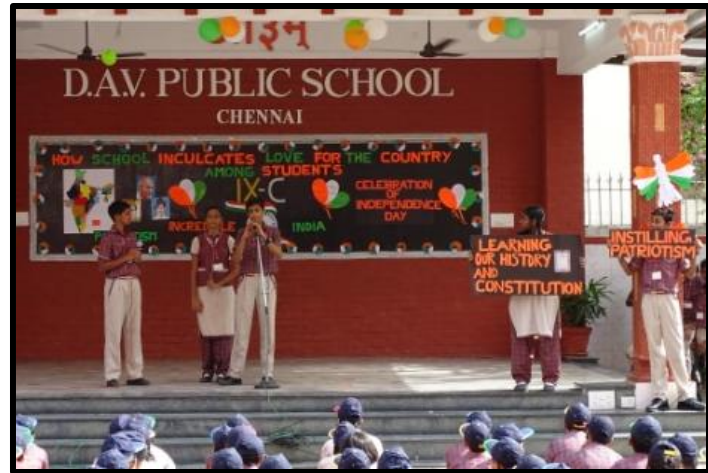
Instilling Patriotism through a Skit