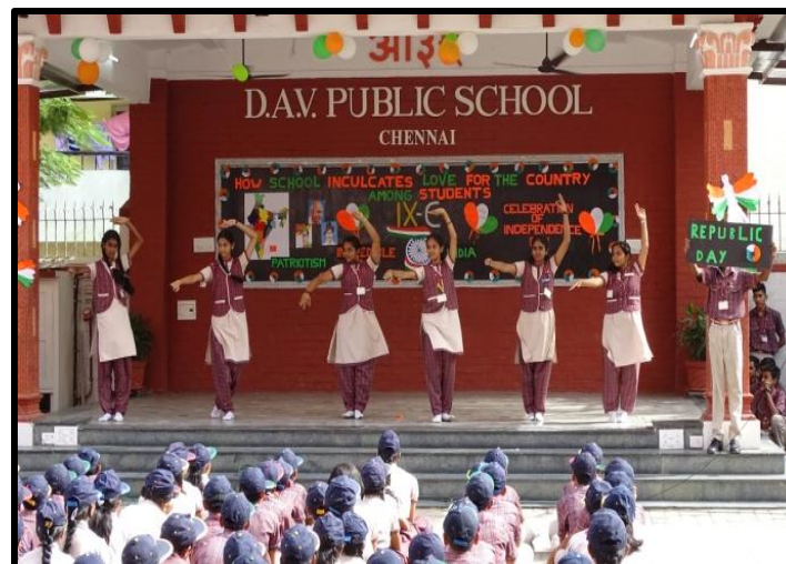
Dance Portraying Patriotism