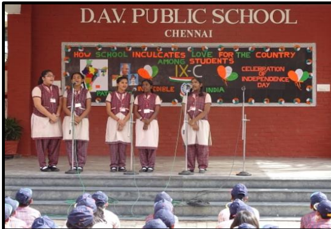
Patriotic Song - "India Stands United" – 'Hai Preet Jahan Ki Reet Sada'

TOPIC : HOW SCHOOL INCULCATES LOVE FOR THE COUNTRY AMONG STUDENTS – 5 WAYS