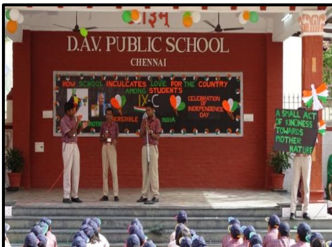
A small Act of Kindness towards Mother Nature