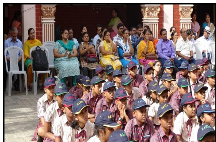
Parents Witnessing the Assembly