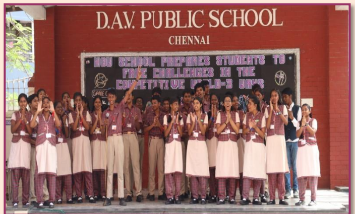
Students of Class X D Ready to Face Challenges