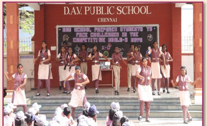
Dance Battle – Showcasing Compassion