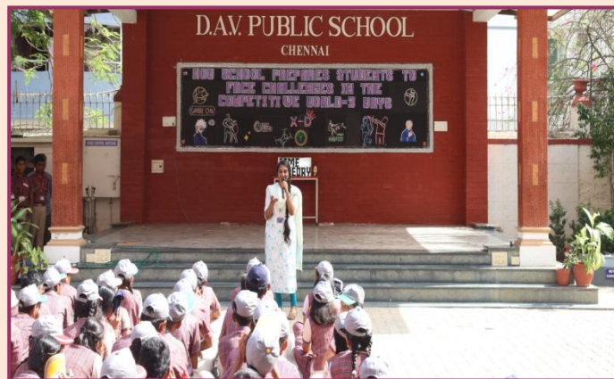
Speech by the Alumnus