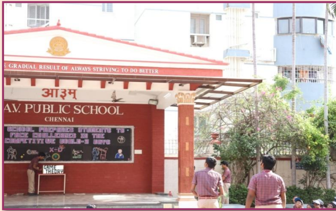
Welcome – Drone Show