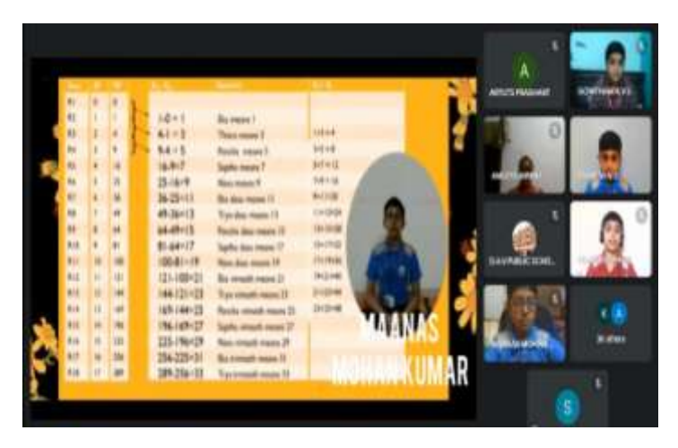
'Talent Champs' - Illustrates Maths In Sloka