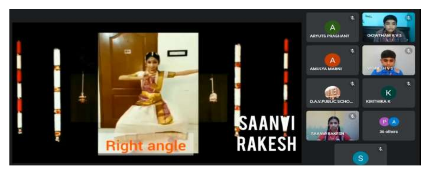
A Dance Treat – Threw Light on Mathematical Patterns