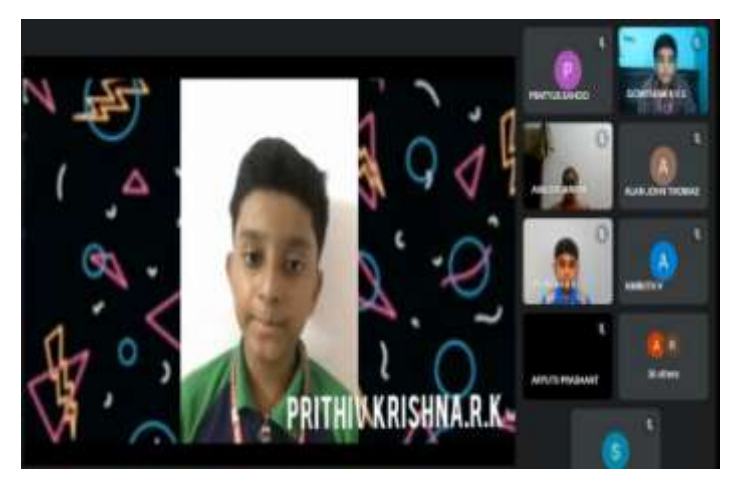
Close look into the topic Logical Mathematical Intelligence