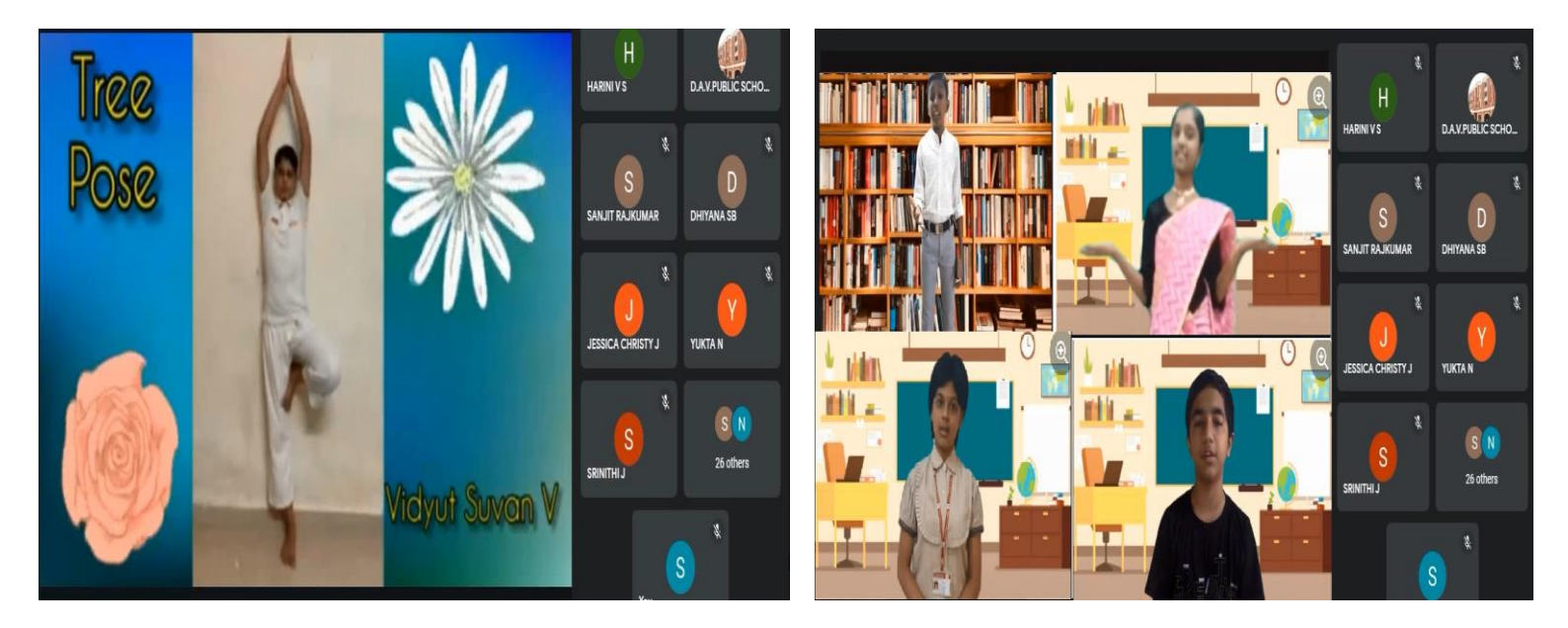
Yoga Contrology – The Key for tolerance