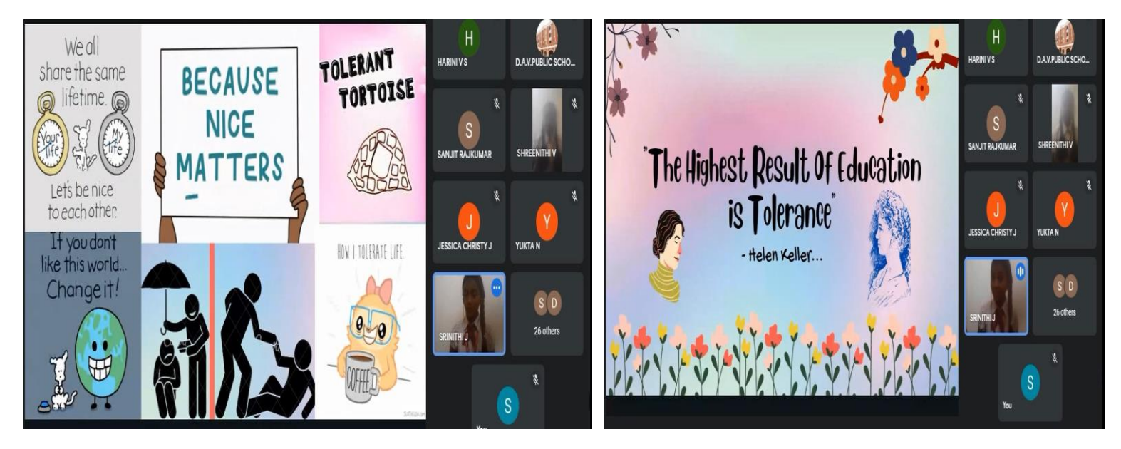
Welcome Speech – Welcoming the Gathering