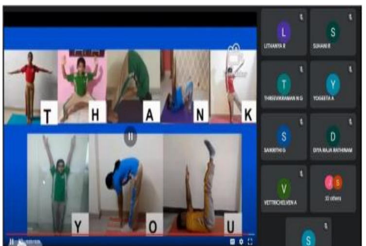
VOTE OF THANKS – YOGA POSTURES