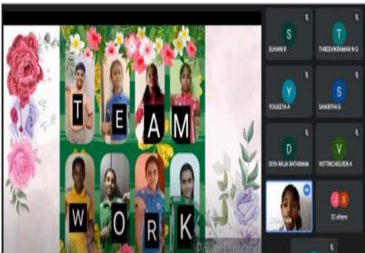
COLLABORATIVE DANCE : TEAM WORK