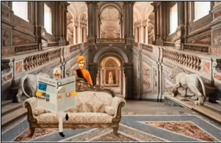
“Heaven scene” – Swami Dayanand Saraswati and Maharishi Hansraj