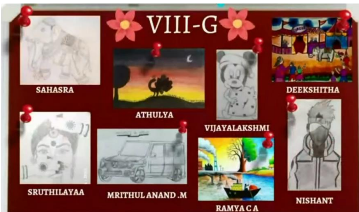
“Creative Corner” – Classroom Display Board