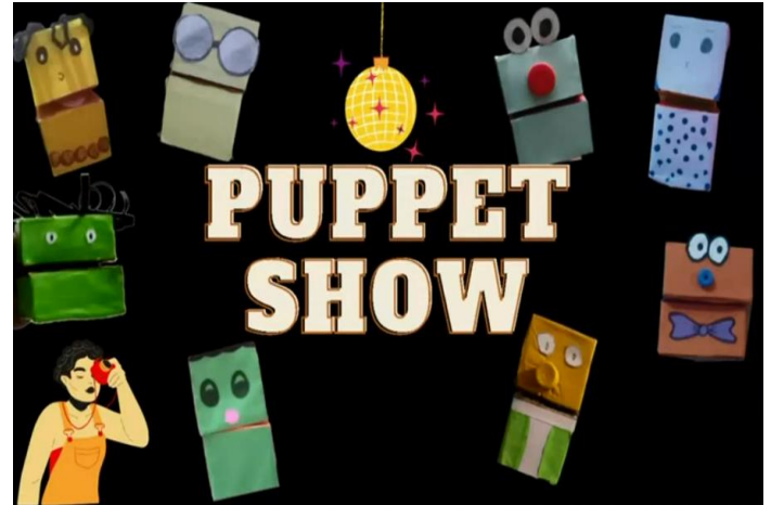
“Puppet Show” – Inculcating creativity through competitions