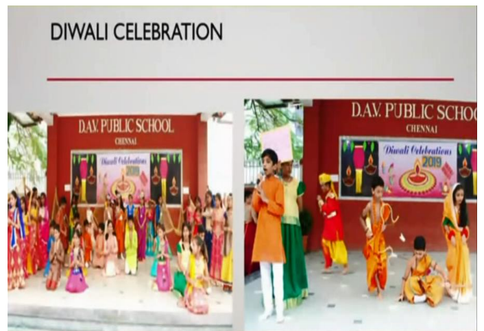
Presentation of Assembly and Celebration Pictures