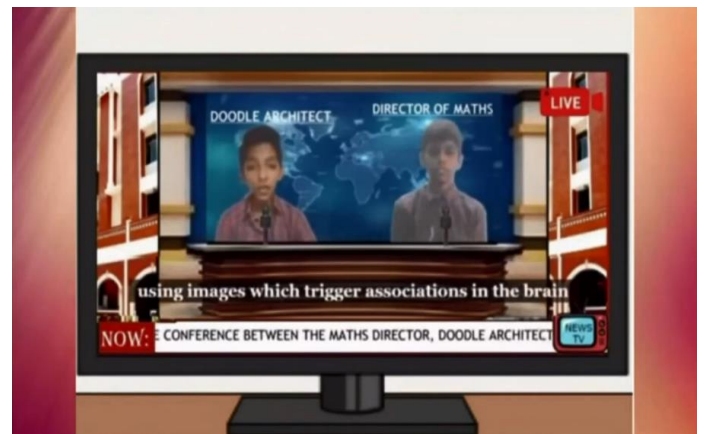
“Classroom Manoeuvres” – Activities Based Learning