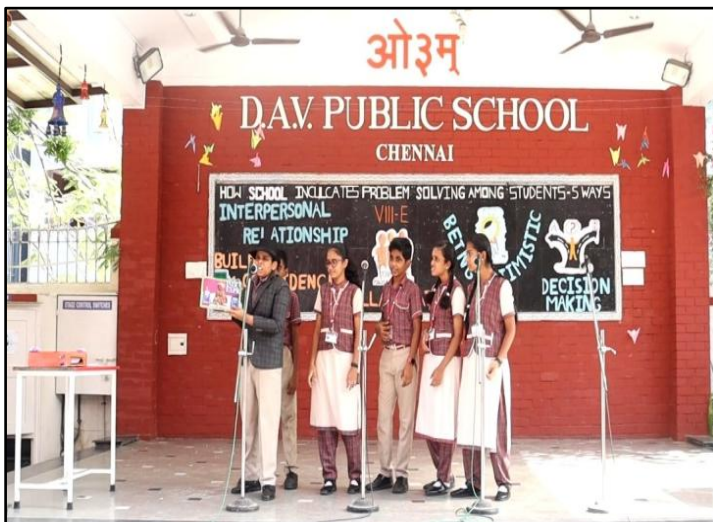
‘Being Optimistic’ – Sherlock Holmes Learning from DAVites