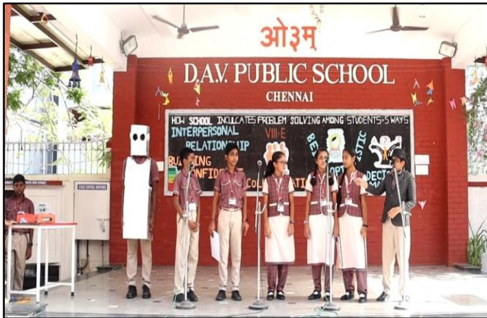
Artificial Intelligence – A Collaboration of Academics and Technology