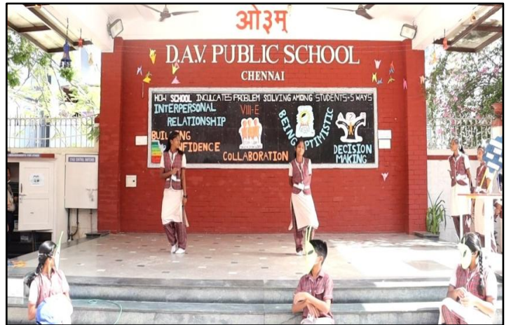
Dance – O – Tune – An Event that Inculcates Quick Decision Making among Students