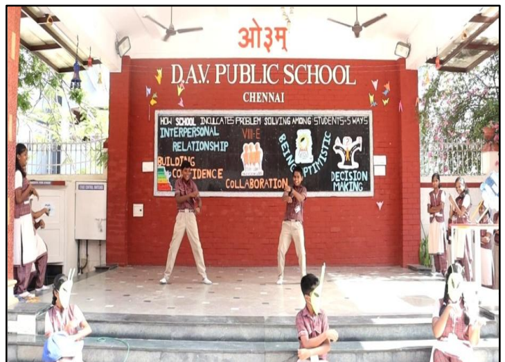
Building Confidence through ‘Interpersonal Relationship’