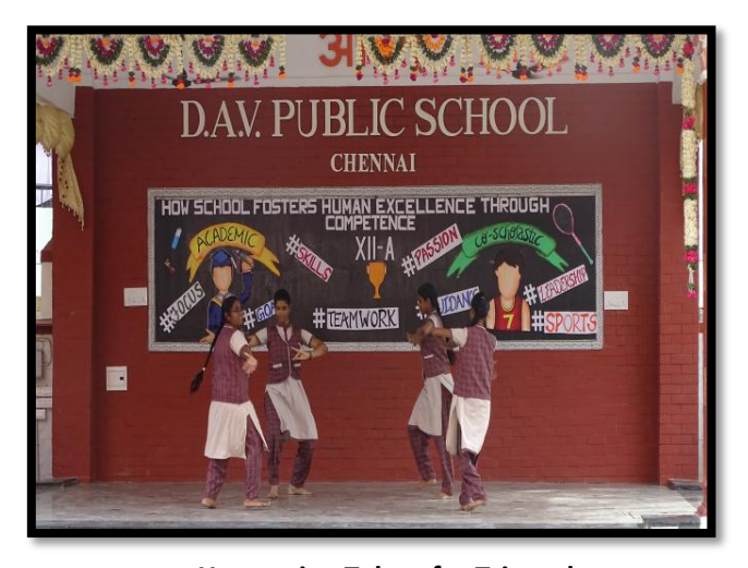
Harnessing Talent for Triumph