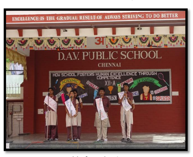
Four Fold of Academic Competence - A Talk show with Puppets