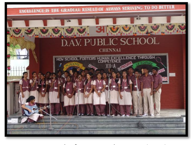
Strength of Team Work- A Song in Unison