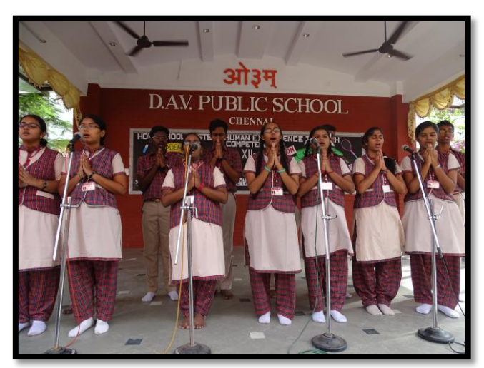
Fervent Morning Prayers