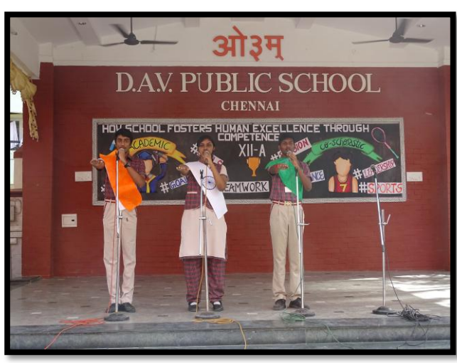
A Spark of Patriotism during the National Pledge