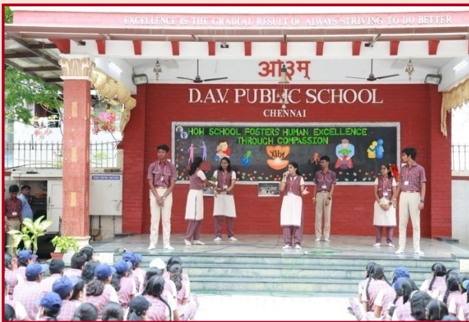
Spreading the Message of Compassion for a Greener World