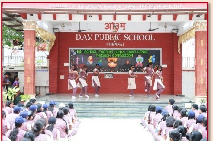
A Peppy Dance Performance