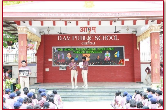
A Sequence Portraying 'Peer Compassion'