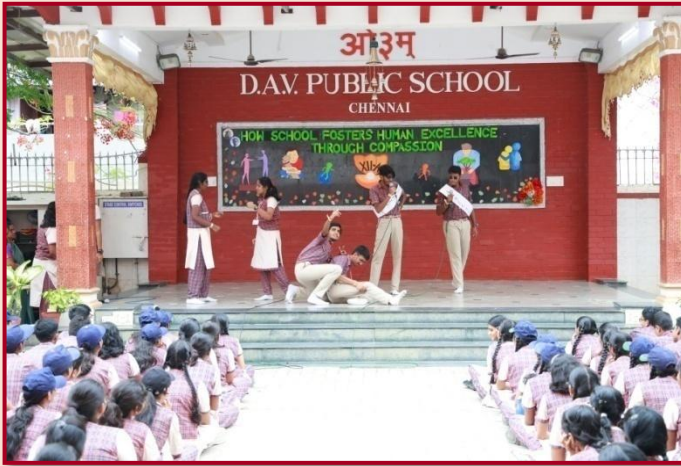
Students Depict World of Self-indulgence and Opportunism