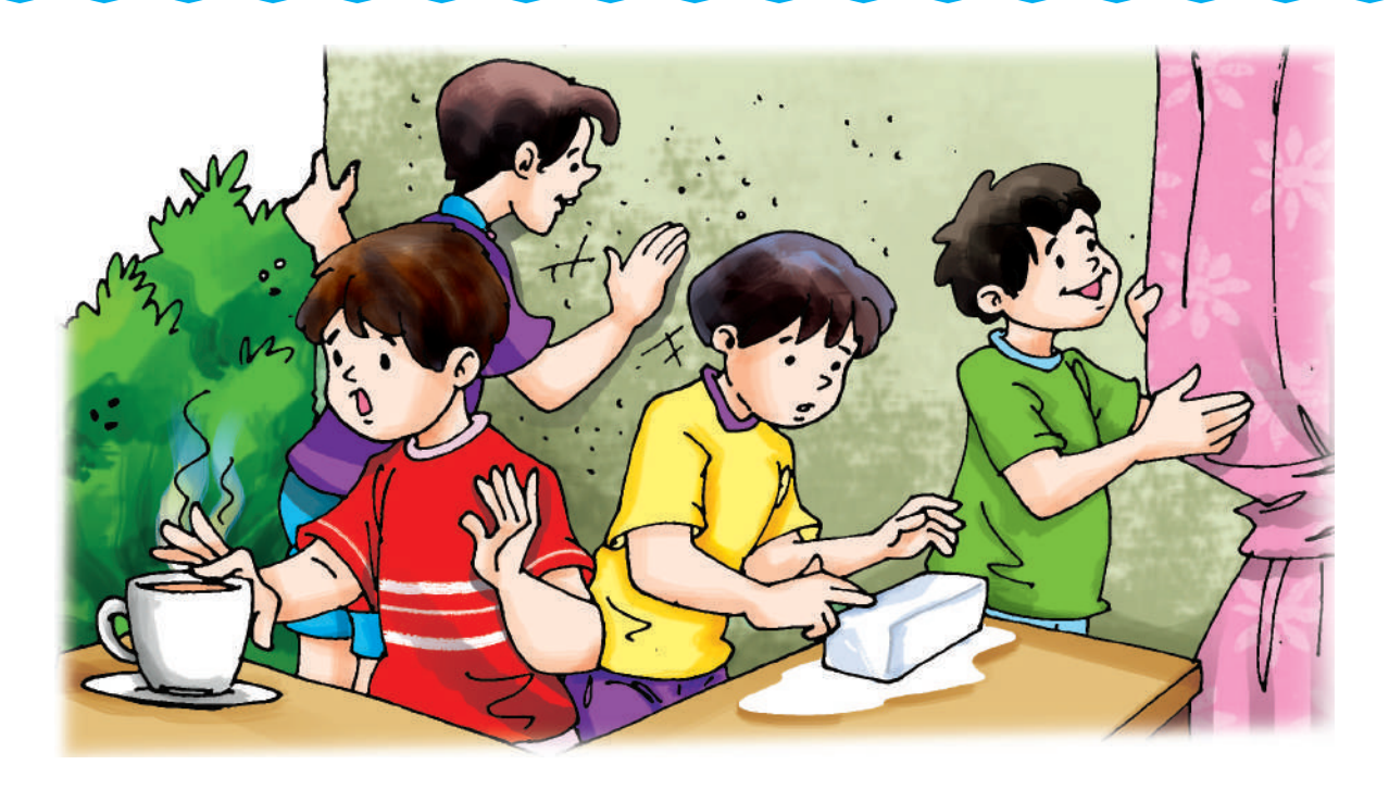
For the Teacher: Ask the students to do this activity at home. Touch a piece of ice and slightly hot water to get to know the feeling of cold and hot.