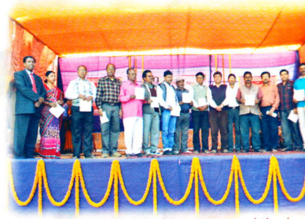
rincipal and Hon'ble D.C. of Jamtara congratulating the p of the students securing C.G.P.A. 10 in the year 2013

As regards to the school's Scholastic and Co-Scholastic achievements, the school has made a mark in the Bihar Zone-II with the phenomenal performance displayed by our students in the C.B.S.E. and D.A.V. Education Board Exams, National Talent Search Competitive Exams, Science, Maths & Cyber-Olympiads, Zonal Tournaments, Zonal Youth Festivals, Zonal Vedic Chetna Shivirs and many more different competitive exams. and tournaments conducted at State and National levels.