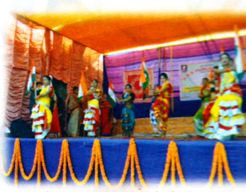
Emphasizing on Co-Scholastic Activ

its Annual Day & Annual Sp the students. The sch general awareness celebrating different Natio Day, The Republic Day, Gar its social responsibilities social reformers like Sw