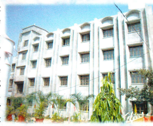
Newly Constructed Senior School Buildin

SAVITRI DEVI D.A.V. PUBLIC SCHOOL, JAMTARA (Jharkhand) is situated just 2 kms away from Jamtara Railway Station and Bus-Stand at Namupara in the out-skirts of Jamtara Nagar Panchayat with lush green environment. The school came into existence in the year 2002 in collaboration with Siksha Vikas Trust, Jamtara with a view to provide qualitative English Medium Education to the tribal and deprived children of Jamtara and its adjoining areas. Since then the school has improved leaps and bounds and now it has become the most leading and reputed educational institution of Santhal Pargana in Jharkhand. The school got C.B.S.E. affiliation in the year 2009 and has become a full-fledged Senior Secondary School with the largest students' strength and the most competent constellation of teachers in the town. Presently, the school owns 5 acres of land.