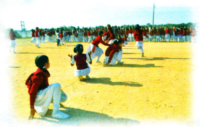
Empowering girls' Personality

We expose our children activities like Essay-writing Extempore, Story-telling, Mimicry etc. Games & Sports Kho, Track & Field events, Volleyball, Badminton etc., Art making, Greeting Card Model making, Birthday Card