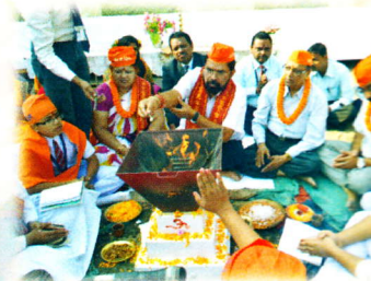
Hawan: The Synchronicity Hon'ble A.C., Jamtara performing

In order to establish a cordial relationship between the school and the parents in respect of the holistic development of the child, P.T.A. meetings are held regularly after every Formative Assessment & Summative Assessment to discuss about the progress of children.